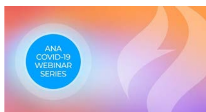
ANA COVID-19 Webinar Series bit.ly/2XMf0GP